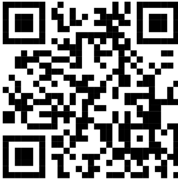
Code des Schweigens